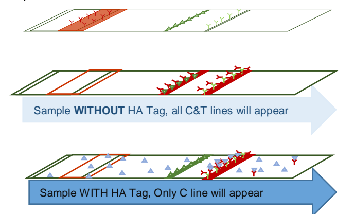
Figure 1. Diagrams illustrating competition LFIA. Top: Layout of an unused test strip. Middle: When a sample without HA tag is applied, four red lines will appear. Bottom: When a sample with enough HA tag is applied, one control line will appear.

In the 37ExpressVue® HA Tag 4-Line Rapid Test, a HA tag antigen of 3 different concentrations was immobilized on the membrane as 3 test lines, in addition to the control line. Therefore, in the negative samples without HA-tagged protein, four distinct lines will appear on the test strip after testing. Increased concentration of HA tagged protein in samples will cause the disappearance of test lines from low concentration to high concentration of the immobilized antigen. The HA Tag 4-Line rapid tests may be used in semi-quantitative determination of HA tagged protein.